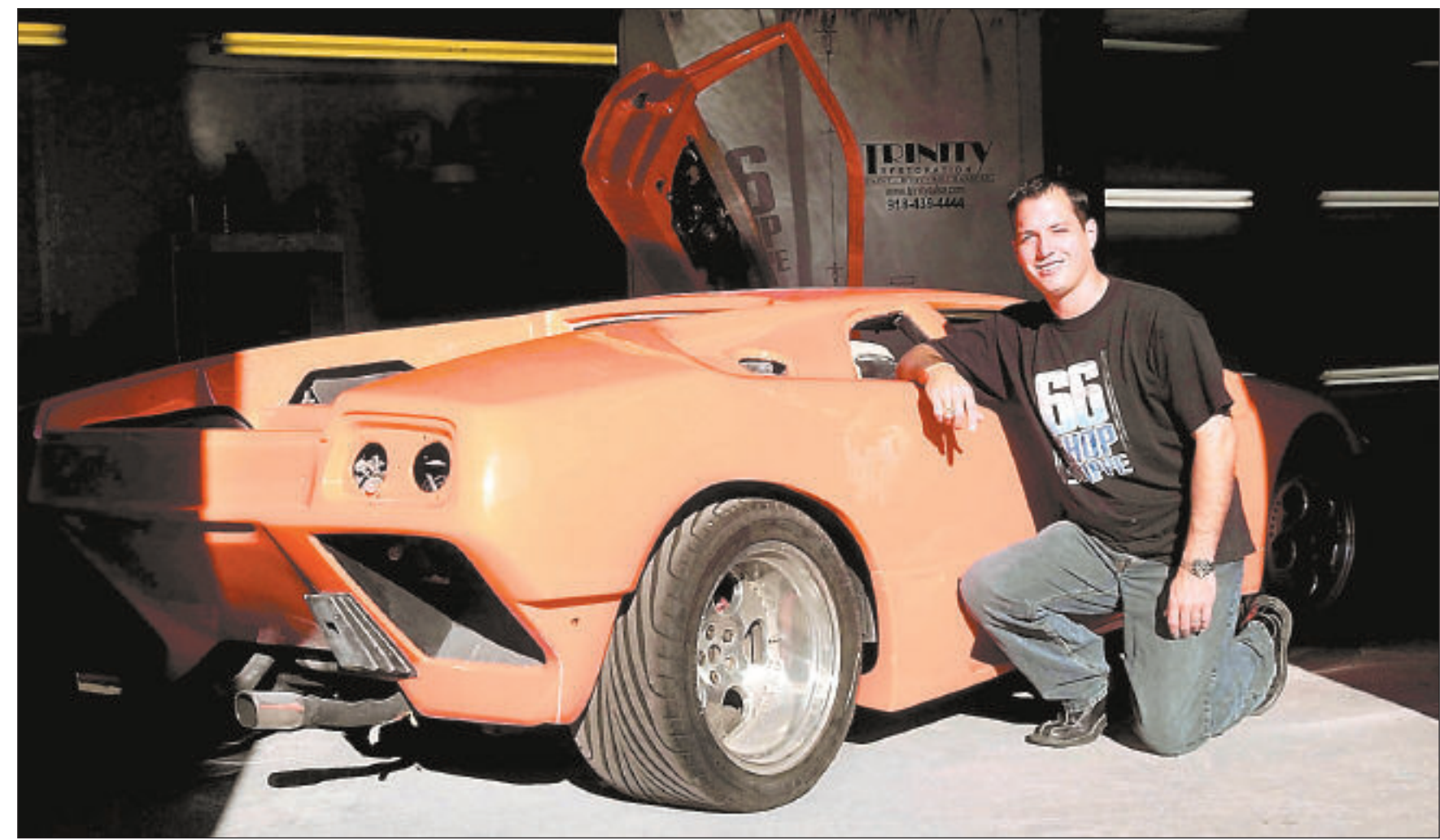
SHERRY BROWN/Tulsa World

stands at the lowest point in more than 16 years. Blackburn said he's still confident in the Tulsa market because the local economy, including employment figures, remains healthy. could spread here. The area has also avoided most of ea's home market remains strong. the effects of the national housing slowdown so far. emotions.' "Tulsa's the last one to go into these slowdowns, and they're the last